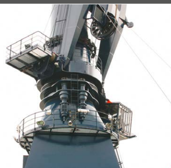
Deck cranes with 3-row roller slewing bearings