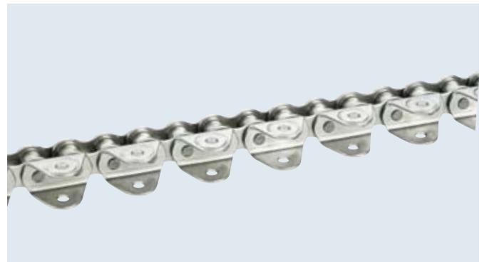
Roller chain stainless steel with clamp plates Application: Packaging industry