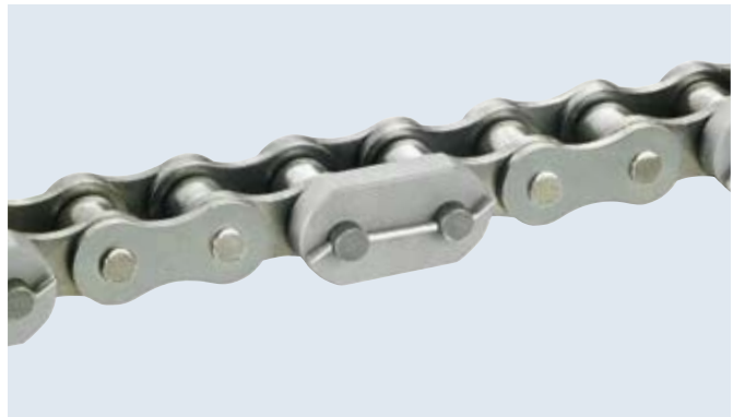
Roller chain with extended cotter pins on one side to house functional components Application: Agricultural technology