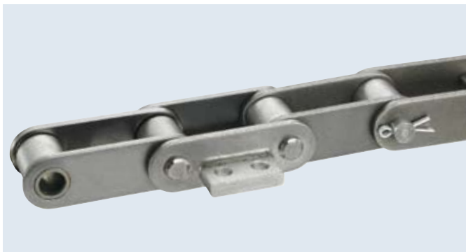
Roller chain with straight plates and welded on attachments and cotter pins on one side Application: Materials handling