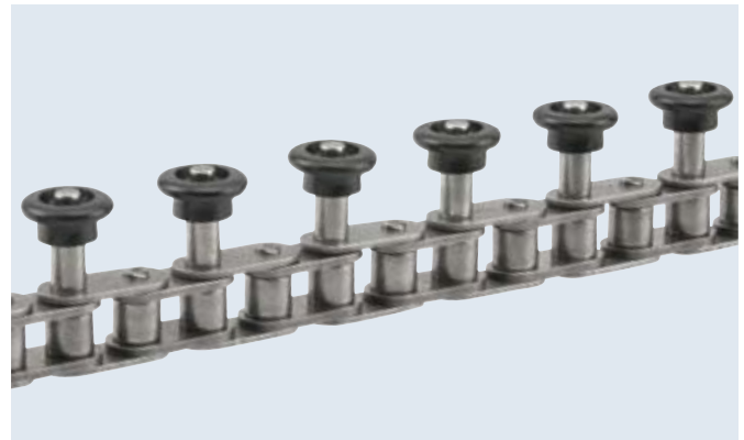
Roller chain with mounted special rollers, electrically conducting Application: PCB industry