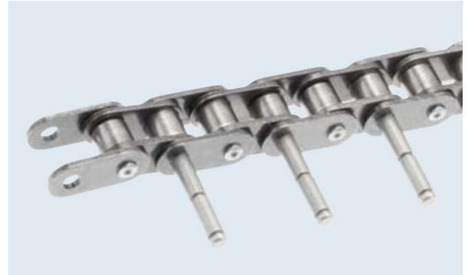
Roller chain with extended pins on one side and double cut-ins in special dimensions Application: Materials handling