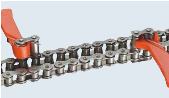
Roller chain with spring-loaded plastic attachments Application: Positioning of bulk goods