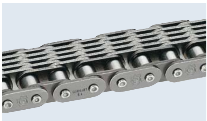
Special chain as combination of leaf chain (support) and roller chain (drive) Application: Materials handling