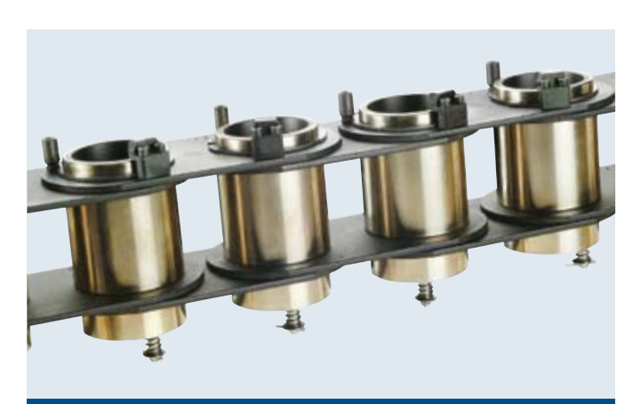
ATC magazine chain 340 with nickel-plated pots to house tools Application: Production technology