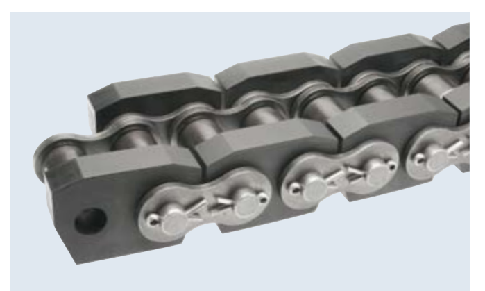
Roller chain with plastic sliding plates to gently transport load bearing systems Application: Automotive industry