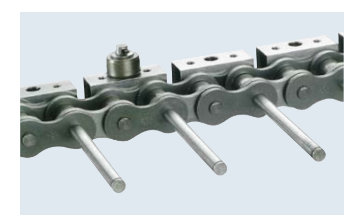
Roller chain with extended pins and functional components with rollers on one side Application: Materials handling / Glass industry