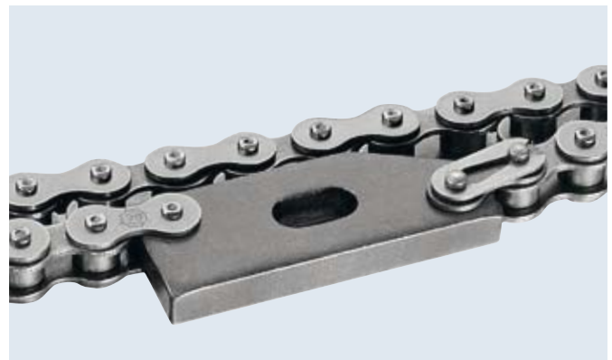
Roller chain with integrated functional component Application: Equipment technology