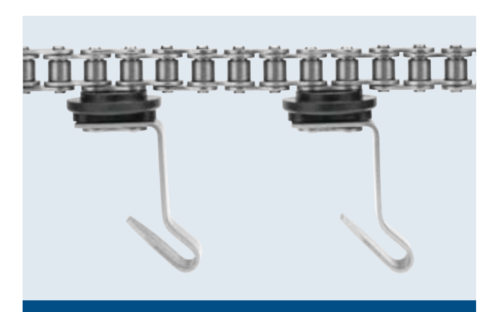
Roller chain with special attachments and sliding parts Application: Clothing industry