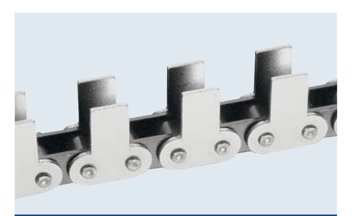
Special chain with plastic inner links and straight attachments on both sides Application: Laboratory techniques