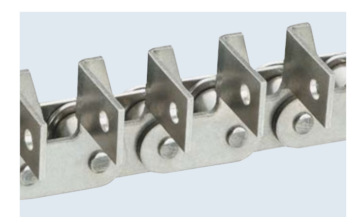
Roller chain stainless steel with straight and bent inner and outer attachments on one side Application: Materials handling