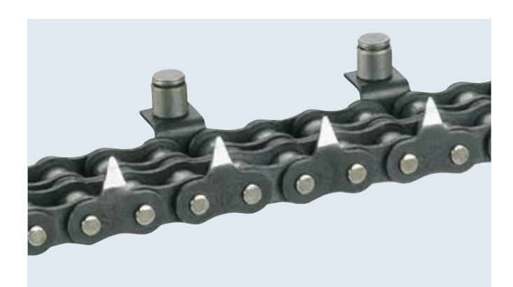
Duplex roller chain with bent attachments and revolving support rollers as well as grinded special attachments Application: Packaging industry / Foil transport