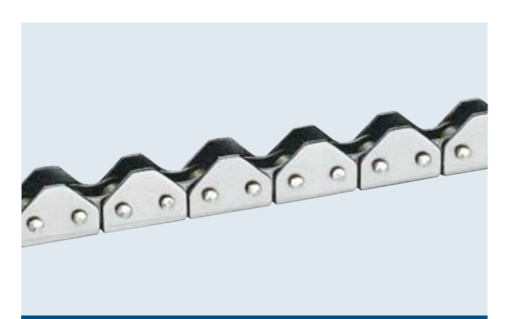
Roller chain with outer plates as U-clamp Application: Cosmetics industry