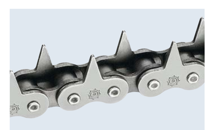
Roller chain with alternately mounted inner and outer plates as attachments Application: Materials handling