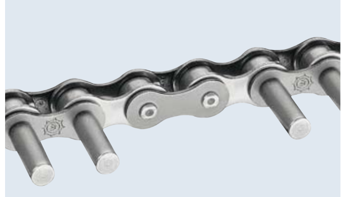
Roller chain with extended pins on one side Application: Materials handling