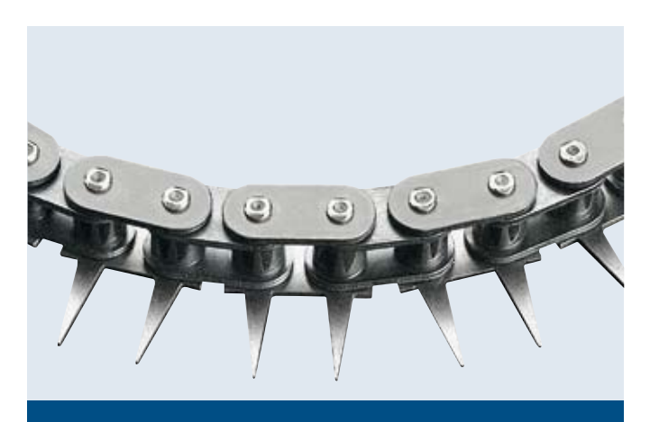
Roller chain with laser-cut, slightly grinded outer plates Application: Timber industry