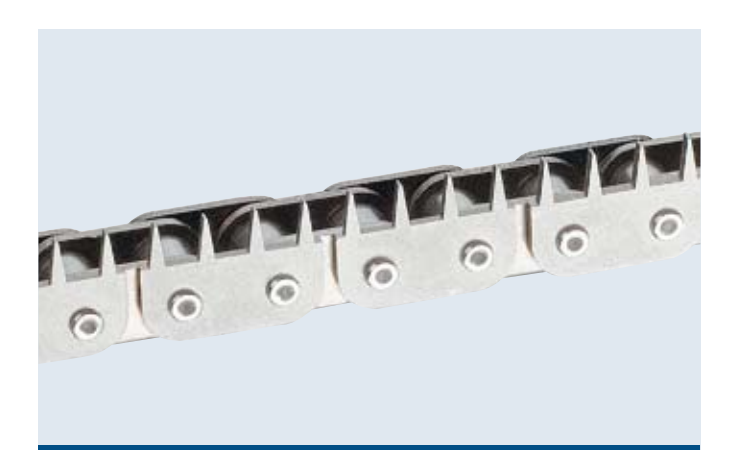
Roller chain with laser-cut outer plates Application: Packaging industry / Foil transport