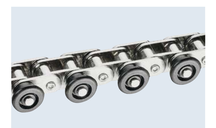
Roller chain nickel-plated with plastic rollers Application: Electrical industry