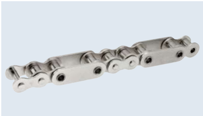
Roller chain with double pitch plates and hollow pins Application: Electroplating