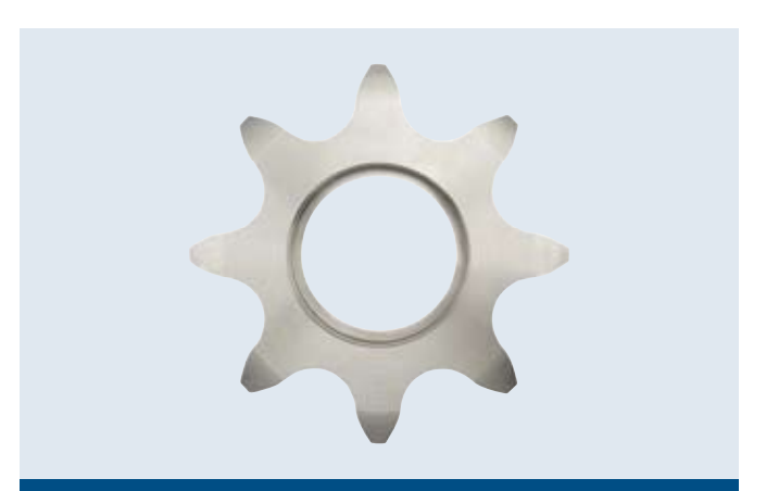
Special plate sprocket