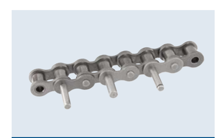
Roller chain with extended special pins Application: Materials handling