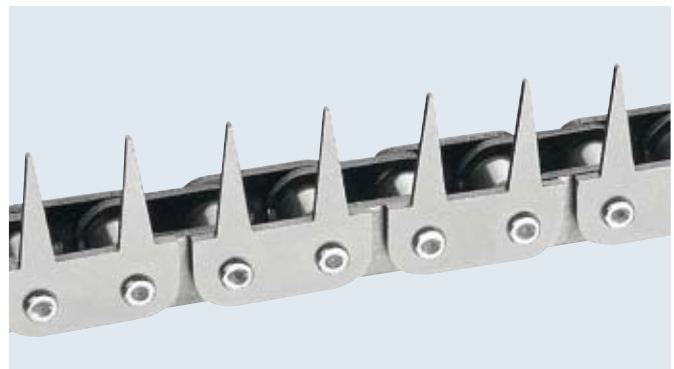
Roller chain with laser-cut outer plates Application: Packaging industry