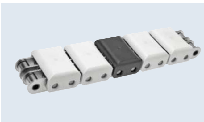
Duplex Marathon roller chain with straight plates and plastic clips Application: Careful conveying of sensitive goods