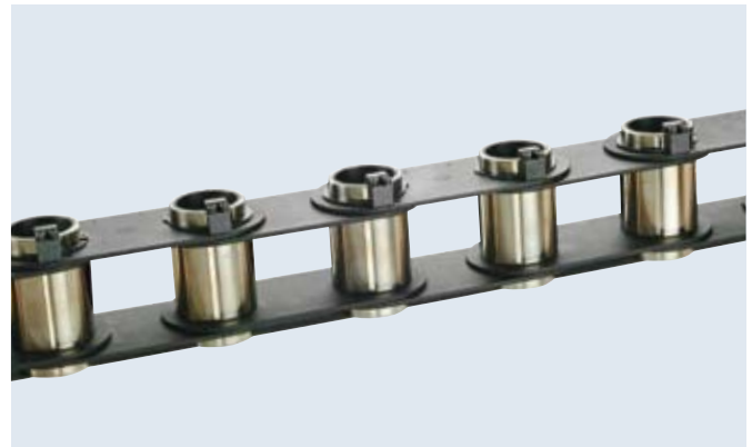
ATC magazine chain 320 with nickel-plated pots to house tools Application: Production technology