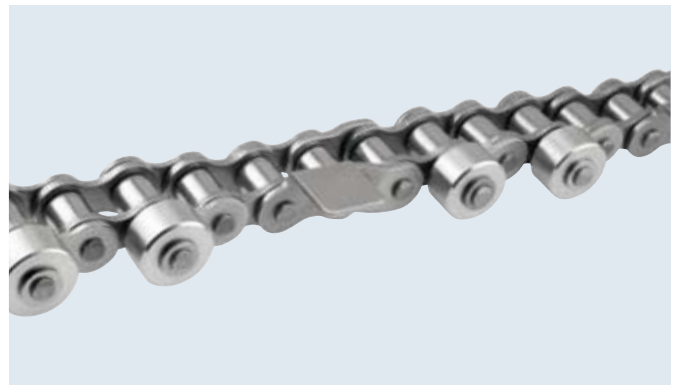
Roller chain with lateral support rollers and bent attachments Application: Materials handling