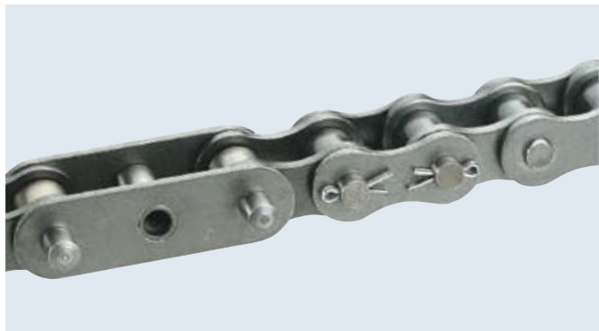
Roller chain with extended cotter pins on one side and special outer link Application: Printing industry