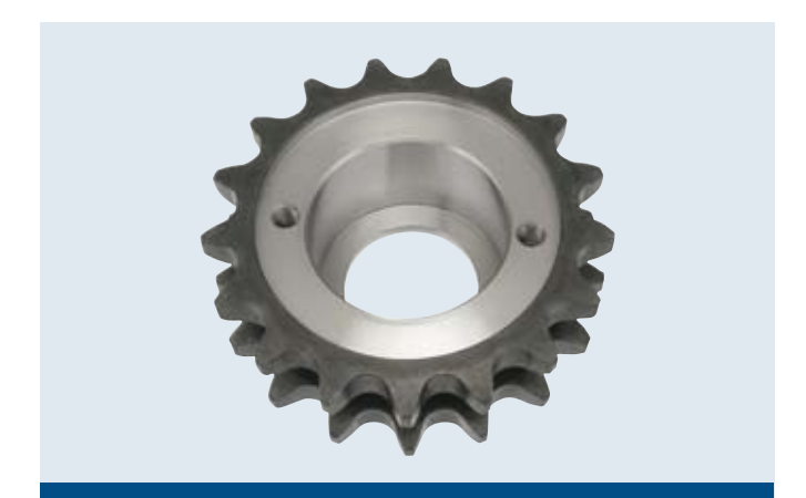
Sprocket with inductively hardened toothing, special hub and tapped bore