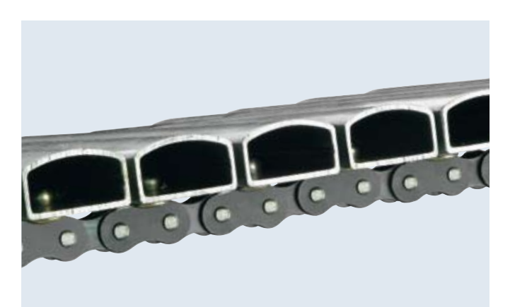
Double strand roller chain with bent attachments on two sides and profiles riveted on Application: Pallet conveyor