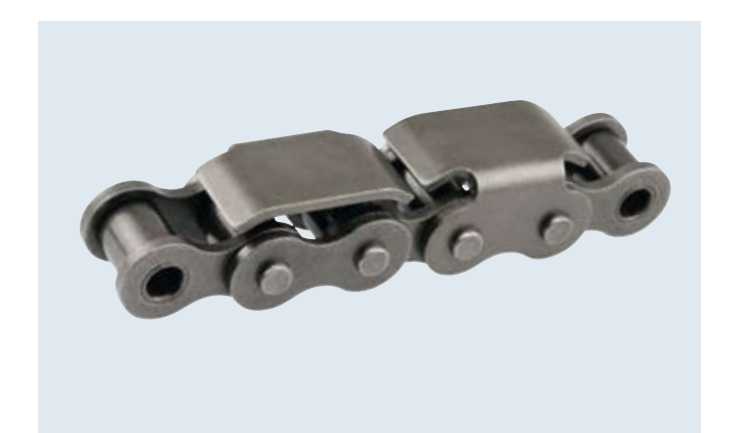
Roller chain with alternately mounted supporting brackets Application: Furnace construction