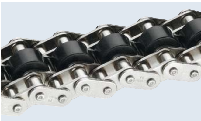
Triplex power and accumulator chain nickel-plated Conveyance and accumulating of bulk goods Application: Materials handling