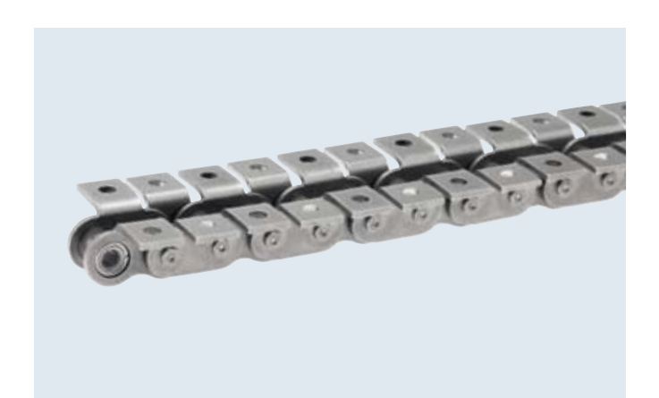
Bush chain with TRIGLEIT bearing and bent attachments on two sides Application: Meat processing industry