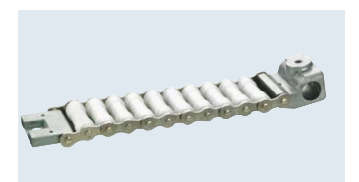
Special chain with nickel-plated pins and plates, wide plastic rollers and special attachments Application: Printing industry