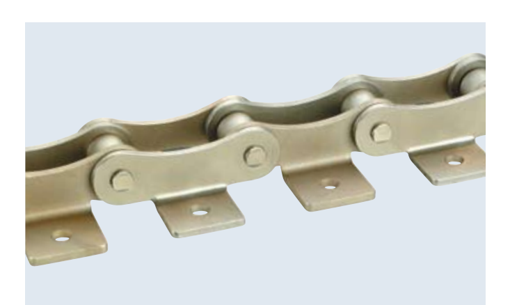
Roller chain nickel-plated with bent attachments on one side at inner and outer link Application: Materials handling