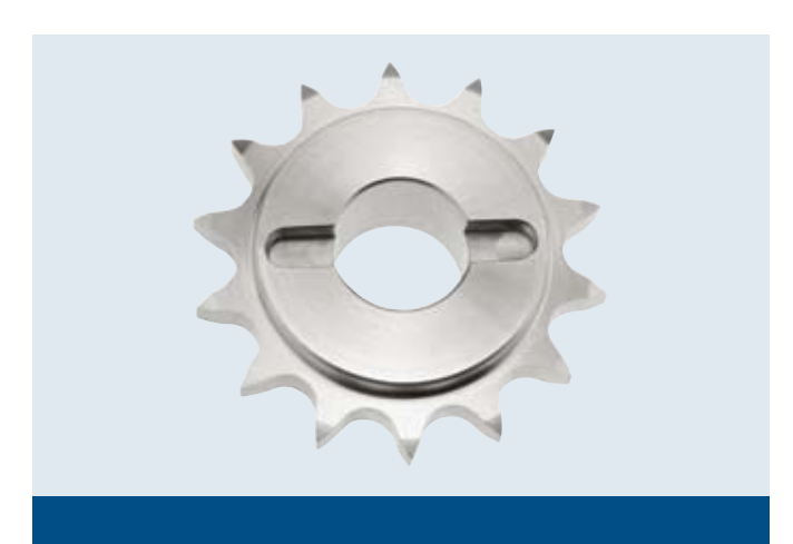
Sprocket with milled in switching boxes