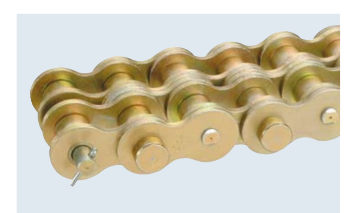
Duplex roller chain galvanized yellow chromated with alternating special attachment pins Application: Hoisting systems