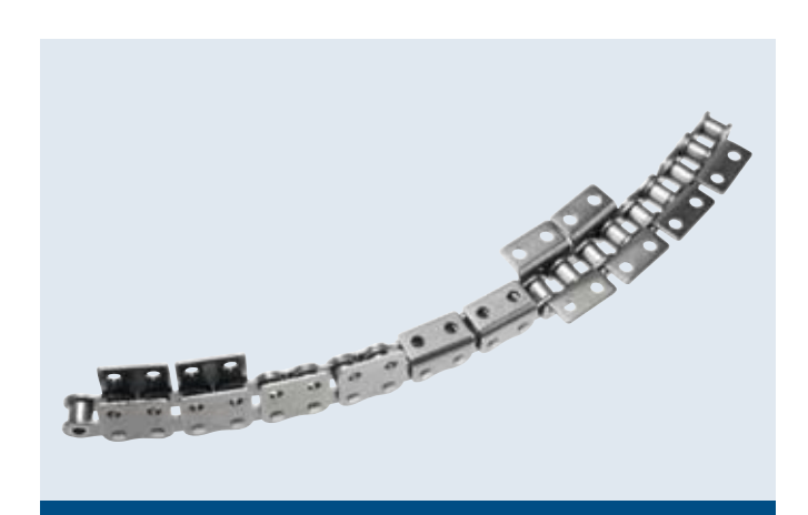
Roller chain suitable for curved paths with different attachments