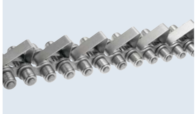
Roller chain push clamps which dip from top down under load (load level variably configurable) Application: Natural stone machining