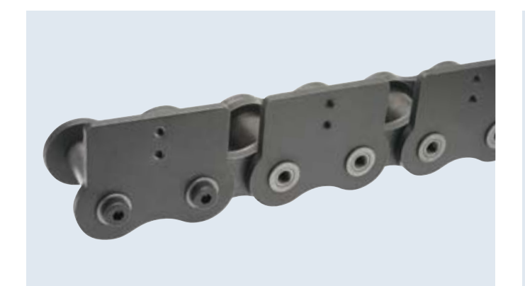
Roller chain with special plates to house die tool carriers Application: Machining