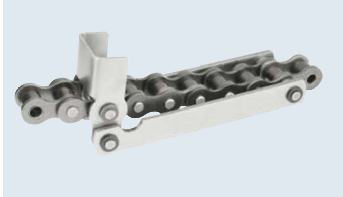
Roller chain with reinforced rocker arm attachment Application: Furniture industry