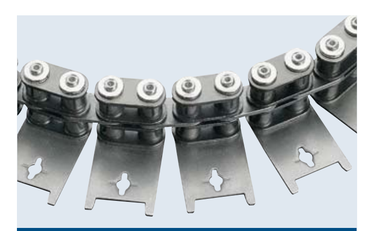
Duplex-Roller chain without outer plates suitable for curves, special plates on one side Application: Materials handling