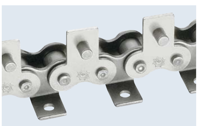
Roller chain stainless steel with bent or straight attachments on one side with pins Application: Materials handling