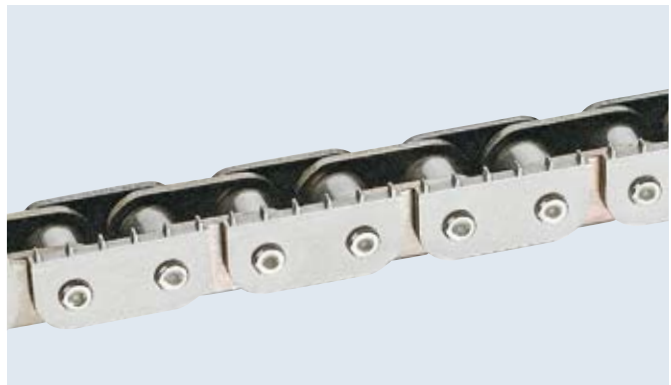
Roller chain with laser-cut outer plates Application: Paper industry