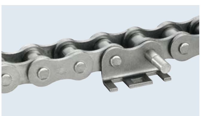
Roller chain with extended pins on one side and special bent attachments Application: Food industry