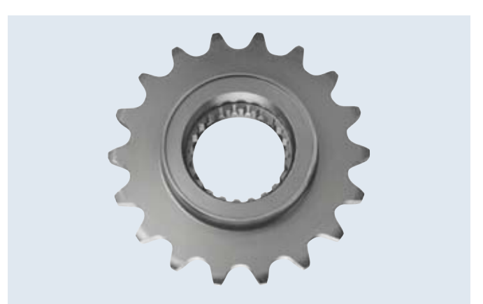
Special sprocket with inner toothed hub