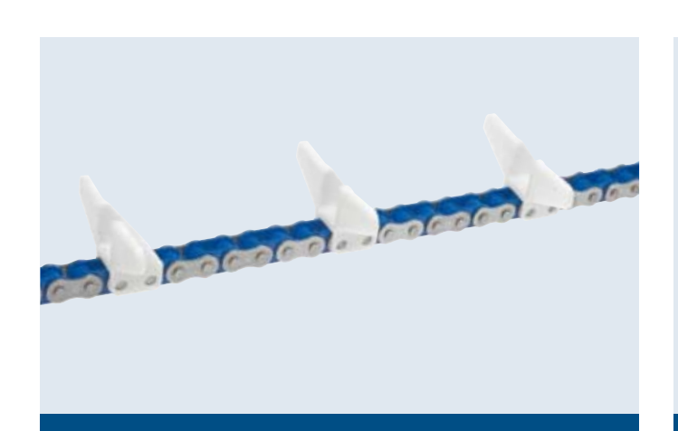
Roller chain with plastic inner links and special clips Application: Packaging industry