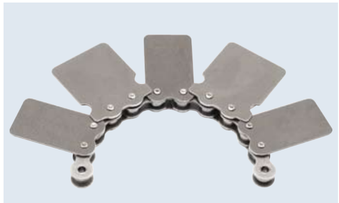
Roller chain with straight attachments for lateral guidance of goods to be conveyed Application: Packaging industry