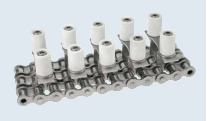
Roller chain with bent attachments and fitted rollers for paternoster cabinets Application: Electrical industry