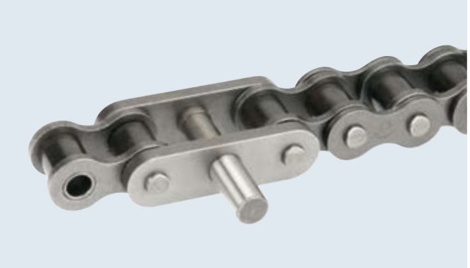
Roller chain with special outer link Application: Printing industry