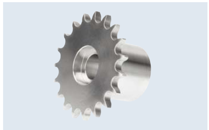
Sprocket with extended hub