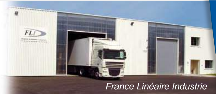
France Linéaire Industrie