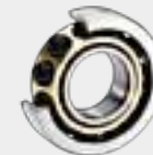
Bronze ball guided cage

7226PJDE-HYB#3 7228PJDE-HYB#3 7320PJDE-HYB#3 7322PJDE-HYB#3 7324PJDE-HYB#3