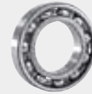
Steel ball guided cage

320S-HYB#3 322S-HYB#3 322SF-HYB#3 324S-HYB#3 326S-HYB#3 328S-HYB#3 330S-HYB#3 332S-HYB#3