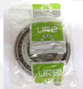
Counterfeit bearings. Fake wrapping foil(left), fake heat sealing bag(right)

Why do companies continue to buy counterfeit bearings?