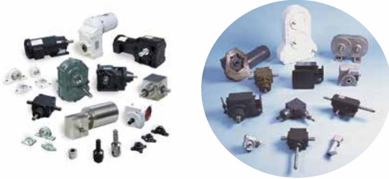
Standard, modified & custom units are built for countless applications.

We know time is valuable, that's why you can count on HUB CITY for support, services and solutions to simplify your installation. Select from a complete line of standard or custom design products.