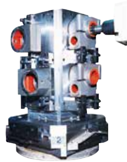
A multi-pallet machining center machines precisely and efficiently.

Since 1892, HUB CITY has a reputation for producing tough, dependable driveline components for industry and agriculture worldwide. As a world-class manufacturer, HUB CITY provides the technology, expertise and support to perfectly integrate our products into your application. Whether your application requires a standard, modified standard or custom product, HUB CITY will always be at the heart of what drives your world.