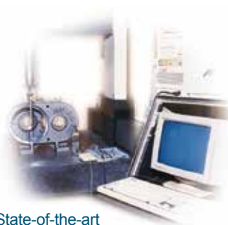
State-of-the-art testing equipment and comprehensive product testing ensures quality.